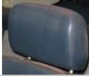
Thin Rectangle Perimeter seams