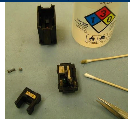
Once the contact is working right, give the entire switch a good cleaning out of the 25 years or so of built-up crud inside. Alcohol and Q-tips work great for this. Especially clean and inspect the base contacts for severe wear. A new switch is warranted if they're too far gone. (Yep, mine was pretty crusty.)