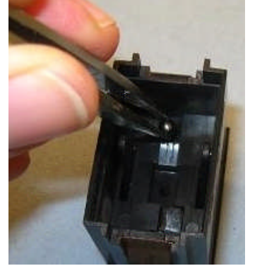
Reassemble. Remember the little metal ball? It goes back in the switch as pictured, at the indent at one end.

Put the spring loaded contact piece back over the 2 plastic prongs on either side of the body. Make sure the little spring is pushing the little ball (a little grease/Vaseline will keep the spring in its hole to do this step); the contact/plastic piece should sit over the end with the little ball. Carefully snap the base back onto the body. VOILA!!!! A newly remanufactured switch ready to do its job.