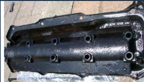
Thoroughly clean the valve cover and/or camshaft cover.

Remove the camshaft. Now you see the lifters. In my engine they are hydraulic and need no adjustment. If they were noisy before the install, now it's a good chance to change them with new ones. They are not that expensive. If your lifters are solid, now is the time to measure them; if they are out of tolerance, replace them.