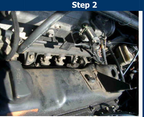
Remove the accelerator cable, ISV* and vacuum hose going to the brake servo; this will give you more room to work.