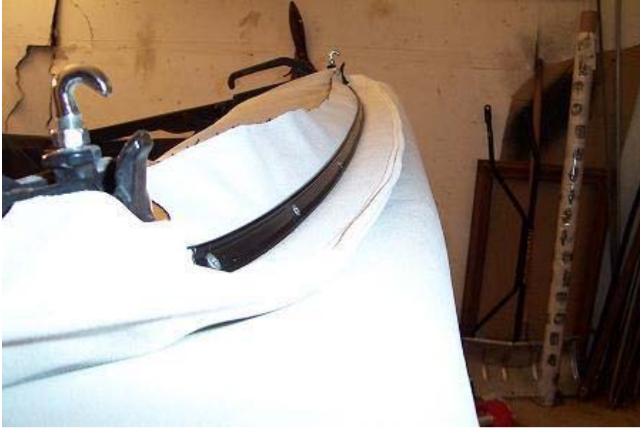
Notch out for the locks