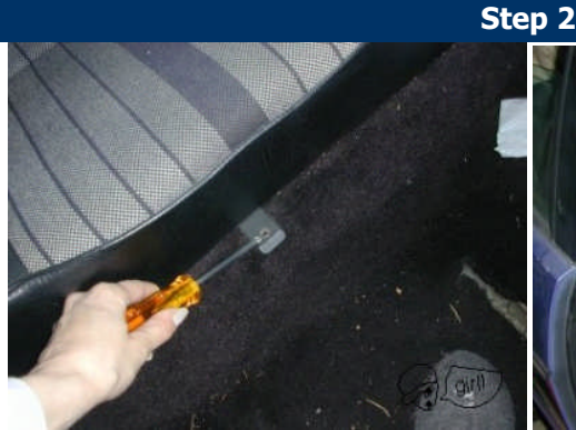
Remove the rear seat by unscrewing the two screws that hold it down. These are right in front of it. Bag the screws and label the bag. Bag and label every screw or other fastener you remove. There will be lots of them. Slide the seat bench forward and pull it out. Set it aside.