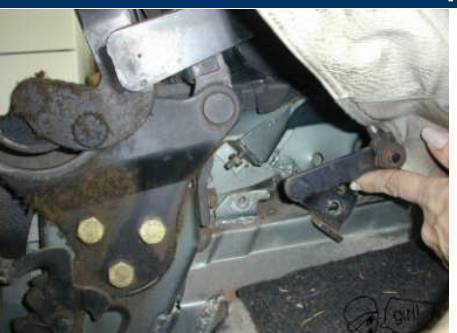
Remove the gas shock bolt. Remove the perpendicular bolt. Take the nut off the rear tension cable.

Study the frame mounting. You will see a cluster of 3 bolts, a fourth bolt holding the gas [strut], and a fifth bolt perpendicular to those two. If you look carefully, you will also see the end of the rear cable for the top.