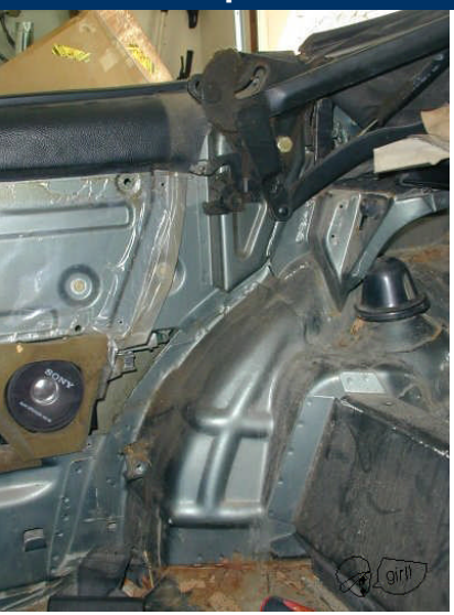
With the bolster trim out, look carefully at the frame mounting. The top should be fully down but released at this time. Note which bolt is visible and mark it with the pen.