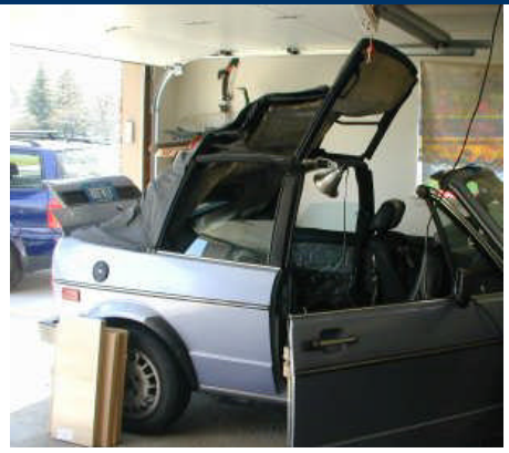
Raise the top halfway.