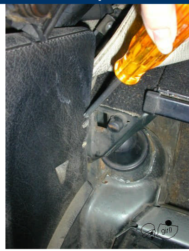
If you follow the curve of the bolster, you will see two more screws that would be hidden by the seatback. Remove those two screws. Pull the top release handle off its lever. Remove the bolster trim.