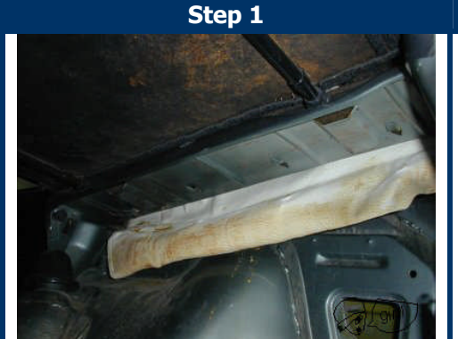
Open the boot (trunk). Look up and find the tabs that the headliner is secured with. Pull the headliner off the tabs and let it hang there.