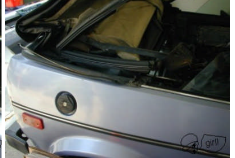
Get out of the car and remove the screws from the [caps] where the boot snaps on.

Get back in the car. Take out the two unmarked bolts by first loosening all three bolts. When you have removed two bolts from each side, lower the top. Remove the last bolt. The top will pop a bit. Since the tension cable is loose on both sides, begin to pull the top out of the channel. Work from each side toward the back. You will likely need to pull on the corded part of the top. Just yank it loose. Peel the top back.