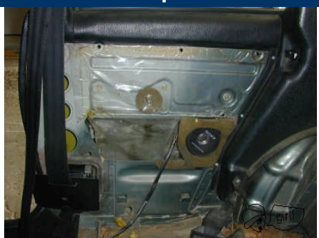
When you get the interior card out, you will see the edge of the rear bolster trim. There are three Phillips screws. Remove them.

Remove the window knob by prying up the cover and unscrewing it. This is in the Haynes and Bentley. Remove the interior card by pulling the door trim away from the edge and prying the fasteners loose. They will pop out. The seat belt trim may have a little holding knockout that will have to be pried up.