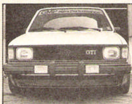
Slick bumper-mounted fog lights are a nice touch, and a relatively easy customizing job that would work well on any GTI or Rabbit.