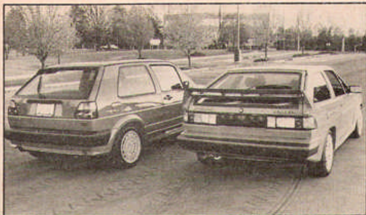
Tall Scirocco rear spoiler complements the aggressive look of the car's body panels. GTI sits more demurely, with lowered stance and wide rubber.