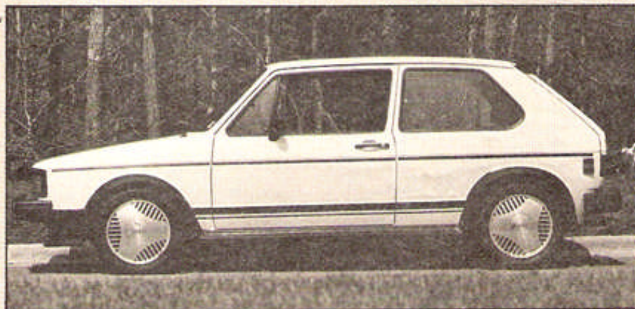
Zender side valances not only improve the car's aerodynamics, but help to cure the age-old problem of road spray and mud being splashed on the sides of the car.

GMP's Project GTI looks aggressive with combination of Zender body pieces, ATS wheels with BFG Comp T/A's, and GMP's suspension system that lowers the car a full inch.