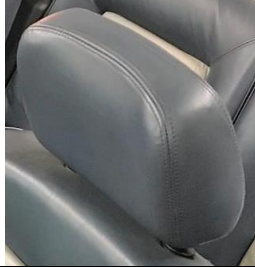
Thin Rectangle Perimeter seams