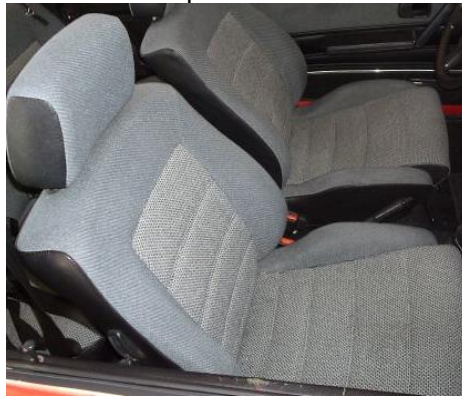
Sport Bucket Bolsters No pillow-effect