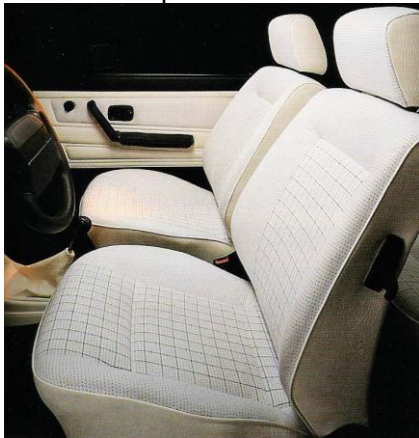
Bucket No bolsters No pillow-effect